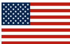
US CME Credit